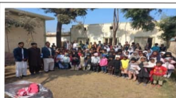
Govt Secondary School, Haripur, District Nushero feroz